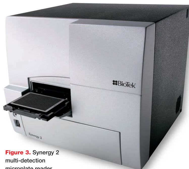
Figure 3. Synergy 2 multi-detection microplate reader.

be utilized in the process. Finally, FP results are resistant to variations from detection instruments.